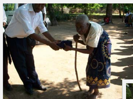
The elderly at the Nsanje project receiving a sweater