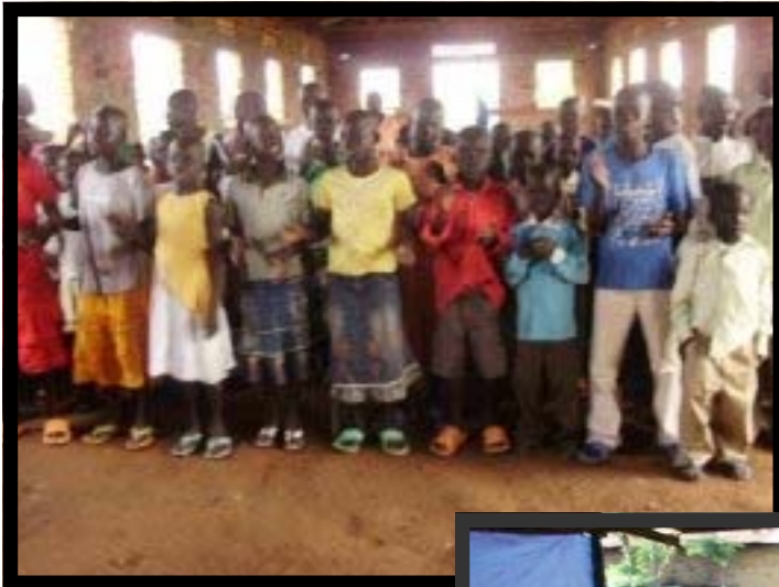
These are orphans which our Sudanese graduates take care of. They are 112 kids place where they are is 2½ Kilometer from Yei a place called Sanja Sili.