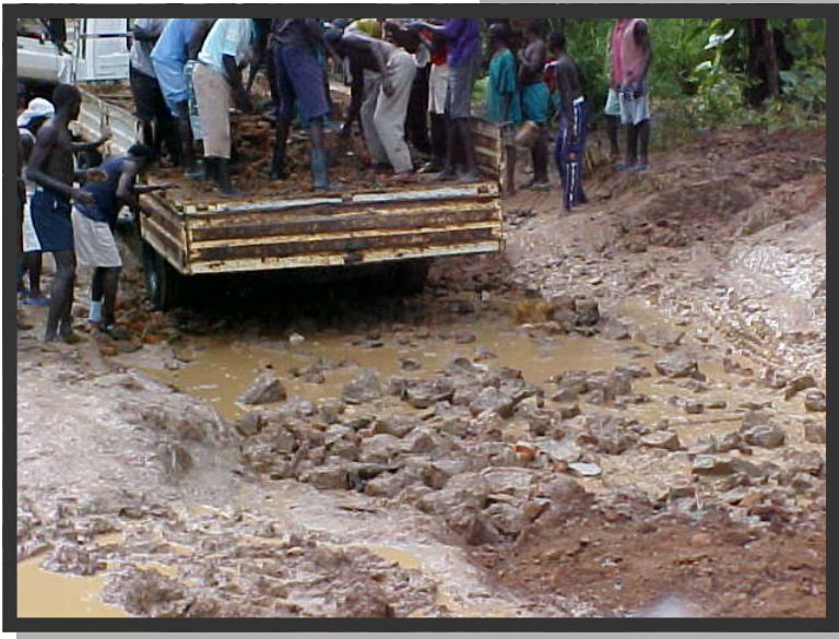
THE ROADS AS THEY WERE IN THE EARLY 2000'S