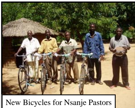
New Bicycles for Nsanje Pastors