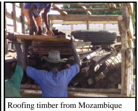
Roofing timber from Mozambique