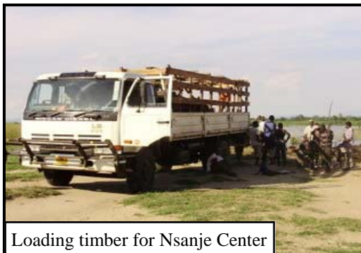
Loading timber for Nsanje Center