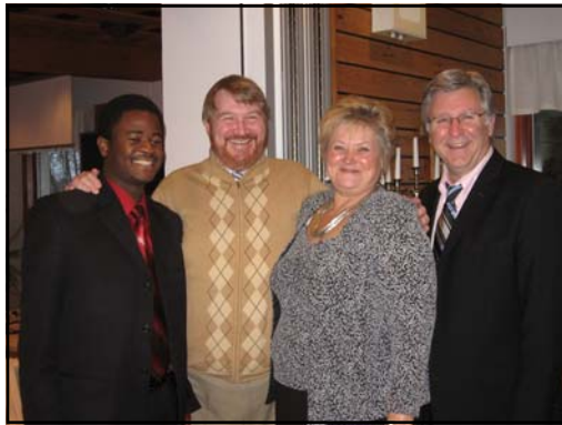
Apostolic Conference Finland

Once again congratulations to the staff and teachers at the academy for all their hard work in preparing these kids and our congratulations to the students who have once again excelled.