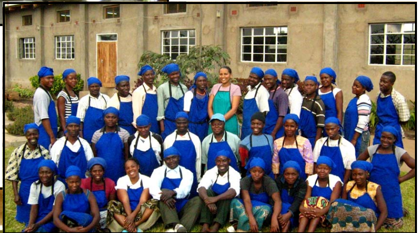
Kalibu Academy kitchen staff