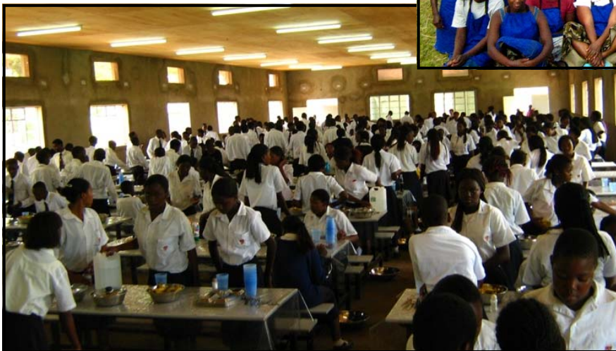
Students at lunch