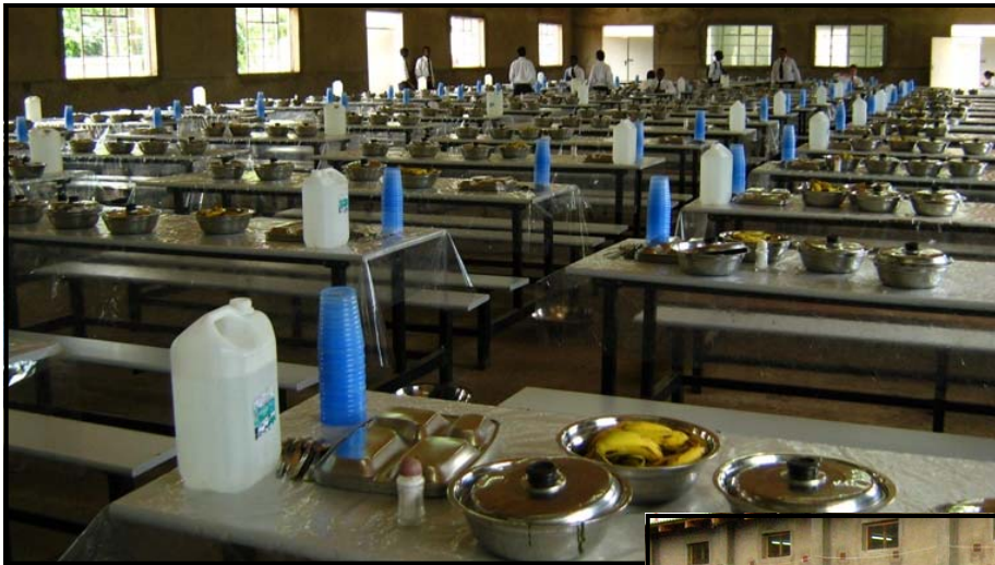
Dining room prepared for lunch