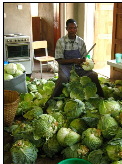
Cutting cabbages for lunch