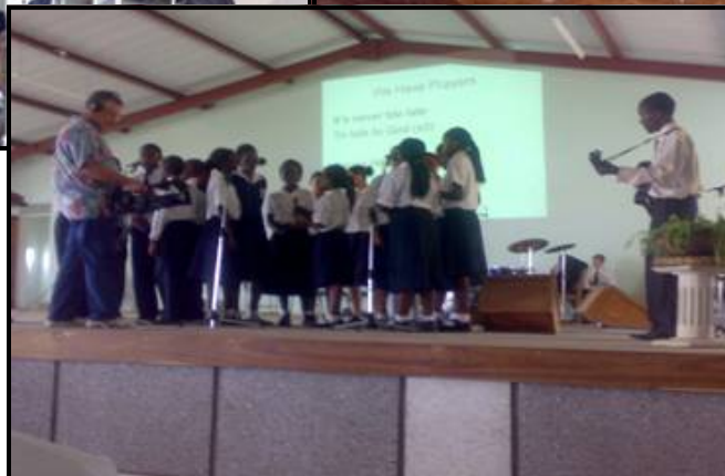
STUDENTS PRACTISING FOR PRAISE AND WORSHIP