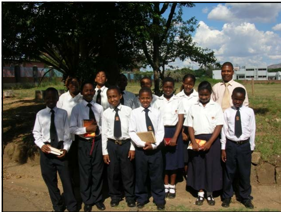
HOSPITAL VISITATION TEAM FROM KALIBU ACADEMY

"We sang for them few songs and children were happy. After that we preached to them the word of God. By the look of their faces it seemed that they found the preaching interesting. We had brought for them some things like food, books and pencils. As we were distributing them we could see how happy the children were. I believe God will heal these children and guide them and they shall no longer be in the hospital. It was such a great experience for me and I would like just to continue helping these people. I know, if we encourage them, children will know our Lord and He will heal and save them."