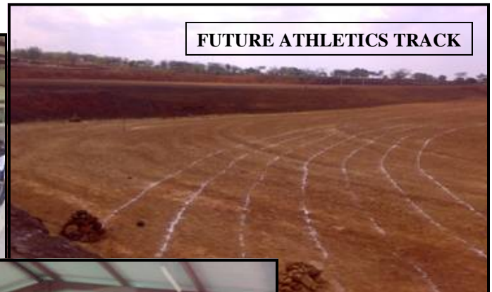
FUTURE ATHLETICS TRACK