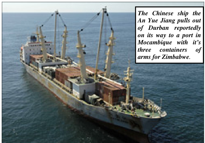
The Chinese ship the An Yue Jiang pulls out of Durban reportedly on its way to a port in Mozambique with it's three containers of arms for Zimbabwe.

Do face the reality of what is going on here and help us SEND OUT THE WORD. The more people who know about it, the more chance we have of the United Nations coming to our aid. Please don't ignore or deny what's happening. Some would like to be protected from the truth BUT then, if we are eliminated, how would you feel? 'If only we knew how bad it really was we could have helped in some way'. [I know we chose to stay here and that some feel we deserve what's coming to us] For now,--- we ourselves have food, shelter, a little fuel and a bit of money for the next meal - but what is going to happen next? Will they start on our houses? All property is going to belong to the State now. I want to send out my Title Deeds to one of you because if they get a hold of those, I can't fight for my rights.