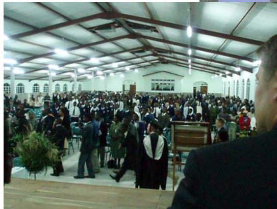
FIRST GRADUATES FROM KALIBU BIBLE SCHOOL IN MALAWI