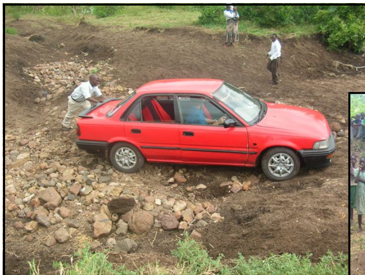
The road to the crusade ground